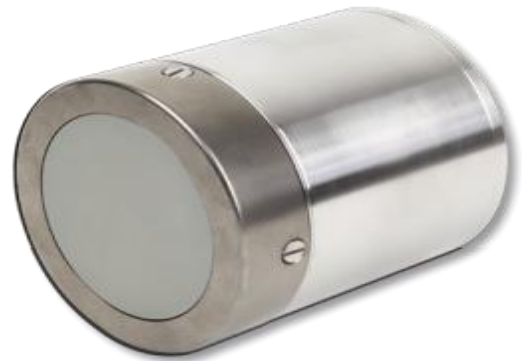
Calibration and monitoring (multi-languages) of max.16 sensors