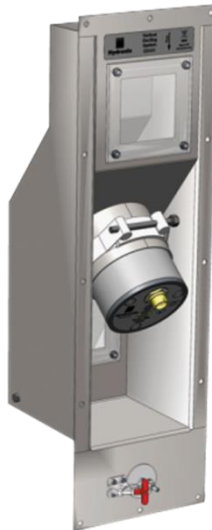
Duct system for by-pass montage

Demo: in by-pass : https://www.youtube.com/watch?v=Xb49EENtPPQ