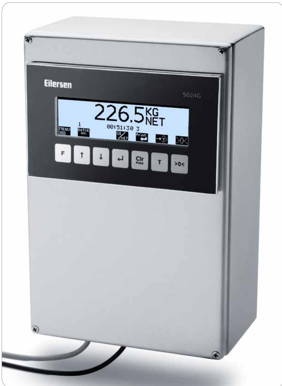
▲ Weighing terminal type 5024G mounted in stainless steel box